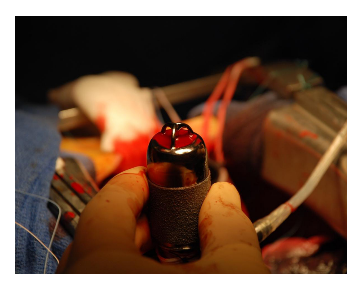
Fig. 1 - Jarvik® 2000 before implantation.

A 57-year-old male with previous Hodgkin's lymphoma had complications related to radiotherapy. Radiotherapy-induced coronary lesions were clinically treated, and severe aortic stenosis justified transcatheter aortic valve implantation. The latter required a pacemaker implantation due to a high-degree atrioventricular block. After temporary clinical improvement, refractory heart failure occurred. Heart transplantation was not indicated and a left ventricular assist device (Jarvik<sup>®</sup> Heart Inc., NY) (Figure 1) was implanted in destination therapy. Three years later, the patient was hospitalized for asthenia and anemia. On admission, VF was discovered although the patient was alert and ambulatory (Video).