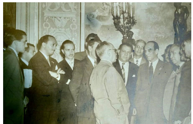
Fig. 3 - Visit to the President of the Federative Republic of Brazil, Getúlio Vargas.

Brazilian North and Northeast surgery will forever be indebted to the work of a true pioneer in the art of thoracic and cardiovascular surgery.