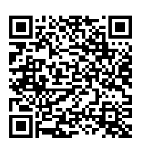
Video 2 - Intraoperative video of the left atrioventricular leaflets with aneurysm. The arrow indicates valve aneurysm.