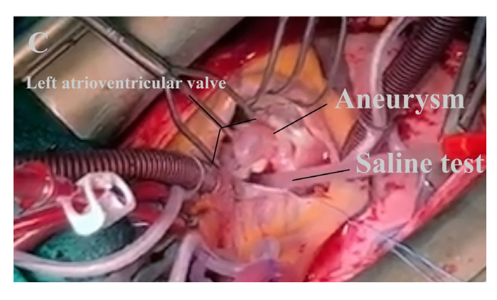
Fig. 2 - Schema of atrioventricular valve with aneurysm before repair (A) and after repair ("cleft" closure and closed aneurysm with autologous pericardium patch) (B). (C) Intraoperative photograph of the left atrioventricular leaflets with aneurysm. The arrow indicates valve aneurysm. MVA=mitral valve aneurysm.

Edge-to-edge closure of the "cleft" was performed (Figure 2B). The aneurysm had a narrow neck arising from the 3-mm ostium, and it was possible to gather all of the emptied aneurysm and simply cover it with an autologous pericardium patch sutured over the aneurysm with running suture (Figure 2B). The final saline test showed no leakage. Ostium primum and ostium secundum were closed with an autologous patch with running suture. TTE demonstrated no left atrioventricular valve leakage with no aneurysm. The patient's postoperative course was uneventful, with a normal sinus rhythm. TTE showed no left atrioventricular valve regurgitation and no valve aneurysm at discharge and one year of follow up.