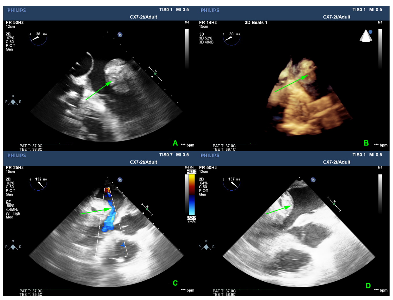
Fig. 1 – (A) Intraoperative echocardiogram showing left atrial dissection; (B) 3D echocardiography; (C) Intraoperative Doppler echocardiography; (D) Early postoperative echocardiogram after the repair.

During the immediate postoperative period, there were signs of LVAD low-flow due to low left ventricular filling and an increasing need for RVAD support. Additionally, serial transthoracic echocardiograms showed a hyperechogenic lesion in the left atrium that resulted in mitral valve inflow obstruction.